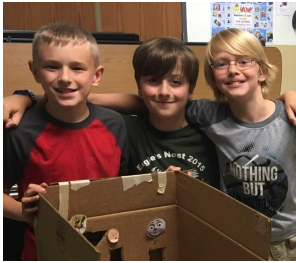
SmartLab students from Prairie View created arcade games out of cardboard and raised $216 for the East Troy Community Resource Center.