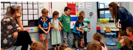
Co-teaching, flexible learning spaces, and student choice are examples of keeping students at the center of the learning process.