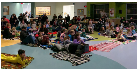
Monthly parent and community education nights are facilitated to cover various mental health and parenting topics.

Want even more reasons to celebrate? Follow us to see all the BIG things that happen in our schools every day!