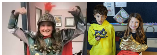
Every school at ETCSD has been recognized for its successful implementation of PBIS (Positive Behavioral Interventions & Supports).