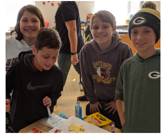
5th graders from Prairie View spend time with students at Lakeland School throughout the year to form positive community connections.