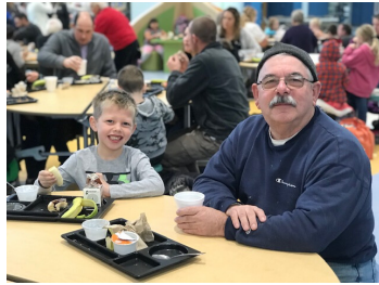
Over 250 parents, grandparents, and family members attended the quarterly PBIS breakfast at Little Prairie.