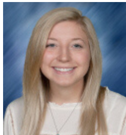
Summer Shroble Prairie View 4th Grade Teacher