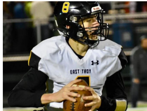
ETCS D was named the 2018-19 Rock Valley Conference All Sports Champion: best overall athletic program in the conference.