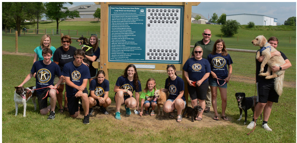
The East Troy Key Club raised funds and organized the construction of a community dog park located next to Village Hall.