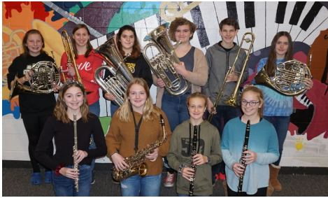
Ten students from the ETMS were selected to participate in the 53rd Annual UWM Honors Band Festival.