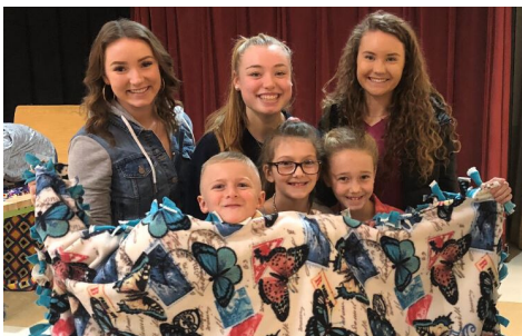
Prairie View students, along with several ETHS students and community members, made blankets to donate to Ronald McDonald House.