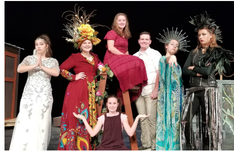
The ETHS drama students did a fantastic job on the Fall 2019 musical production of Once on this Island .