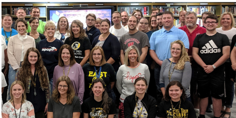
69.8% of the teaching staff at ETCS D holds a master's degree, and 10% are Nationally Board Certified.