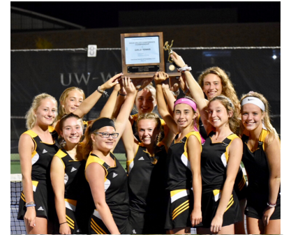
ETHS Girls Tennis team earned 3rd place at Sectionals, and four players advanced to the State Tournament.