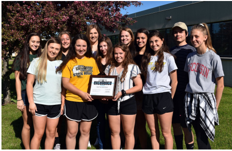
The 18-19 ETHS yearbook was inducted into the Gallery of Excellence by Walsworth Yearbooks.