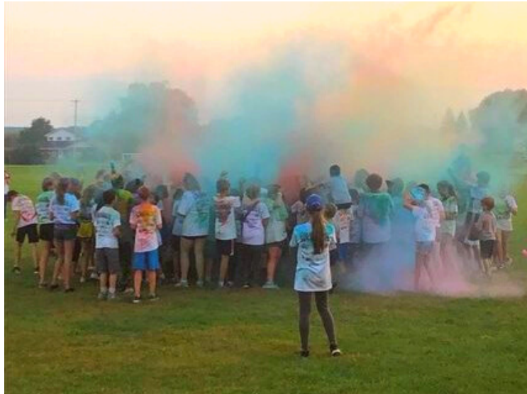
East Troy Middle School students raised $7,824 for their PBIS program during the fall Color Blast event.